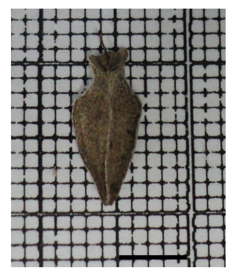
Figure 1. Overview of Z. elegans seeds showing its shape and size. Bar = 0.5cm. Figura 1. Aspecto geral da semente de <u>Z. elegans</u> evidenciando sua forma e tamanho. Barra= 0.5cm;