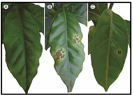
Fig 1. Symptoms on coffee leaves 10 days after inoculation of: (A) crude extract of seeds from asymptomatic plants using multineedle equipment; (B) reference isolate Pseudomonas syringae pv. garcae strain pathotype (CFPB1634); and (C) seed crude extract from plants with symptoms of bacterial blight of coffee.

*Described by Lelliott et al. (1966), Wilkie and Dye (1973), Rodrigues Neto et al. (1981), Schaad et al. (2001) and Maringoni (2010). PST, PC and PSG: respectively, isolates Pseudomonas syringae pv. tabaci (IBSBF 2249), P. cichorii strain pathotype (CFPB 2101) and P. syringae pv. garcae strain pathotype (CFPB 1634) used as reference standards. B1, 9P, 10P and 12P: bacterial isolates from coffee seeds ( Coffea arabica L.). (+) Test positive reaction, (-) Test negative reaction.