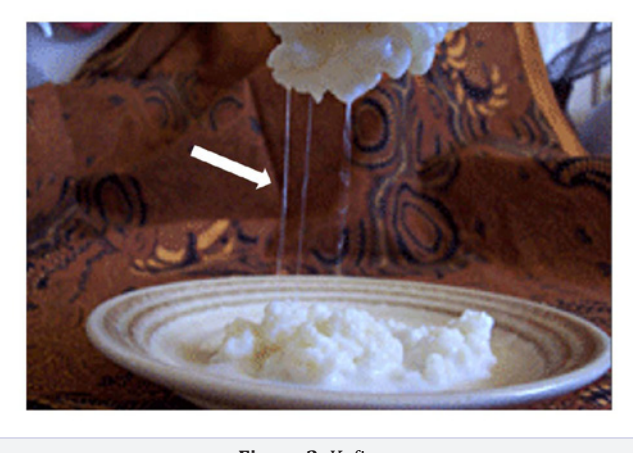
Figure 2: Kefiran.

Currently, the application of probiotics in the food industry is in expansion. The symbiotic relation- ships between different microorganisms present in kefir, as well as their interactions, could assist in the improvement of technological processes and benefits to health. From an industrial point of view, the