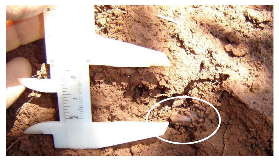
FIGURE 2 Annona crassiflora seed buried by dung beetles at 3 cm deep.