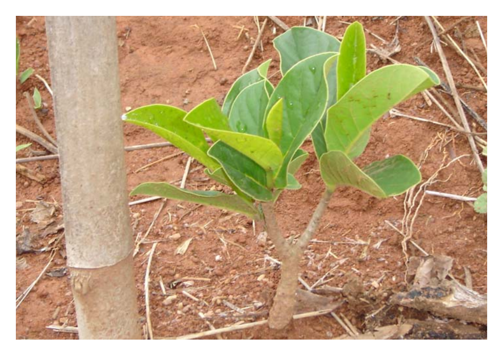
FIGURA 4 Imagem de uma das mudas do banco de germoplasma. A foto foi tirada em dezembro de 2008.