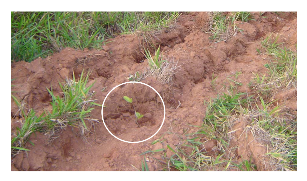
FIGURA 3 Muda de Annona crassiflora plantada no sulco do subsolador.