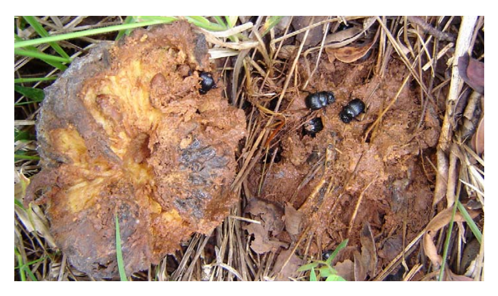
FIGURE 1 Dispersed marolo, Annona crassiflora fruit, being consumed by female dung beetle related to Dichotomius aff. ascanius .