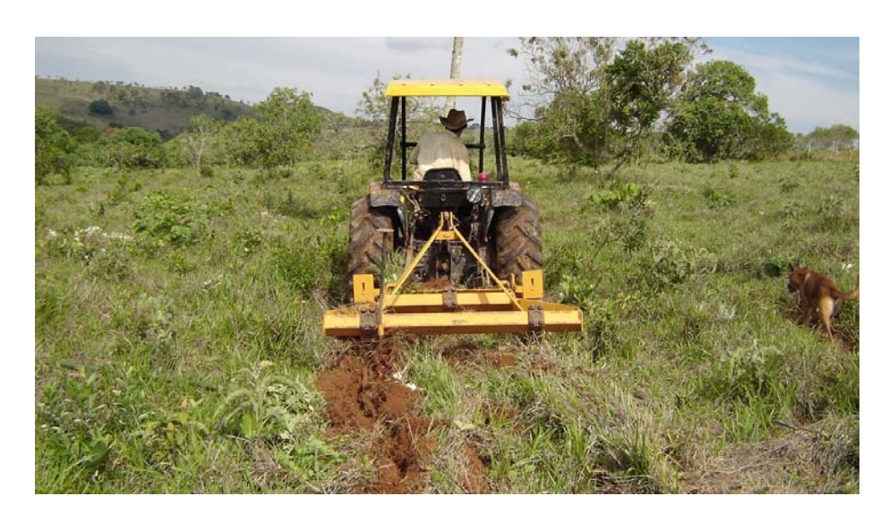
FIGURA 1 Preparo da área com subsolador.

obtidos os dados de sobrevivência, altura e diâmetro ao nível do solo de todas as mudas plantadas.