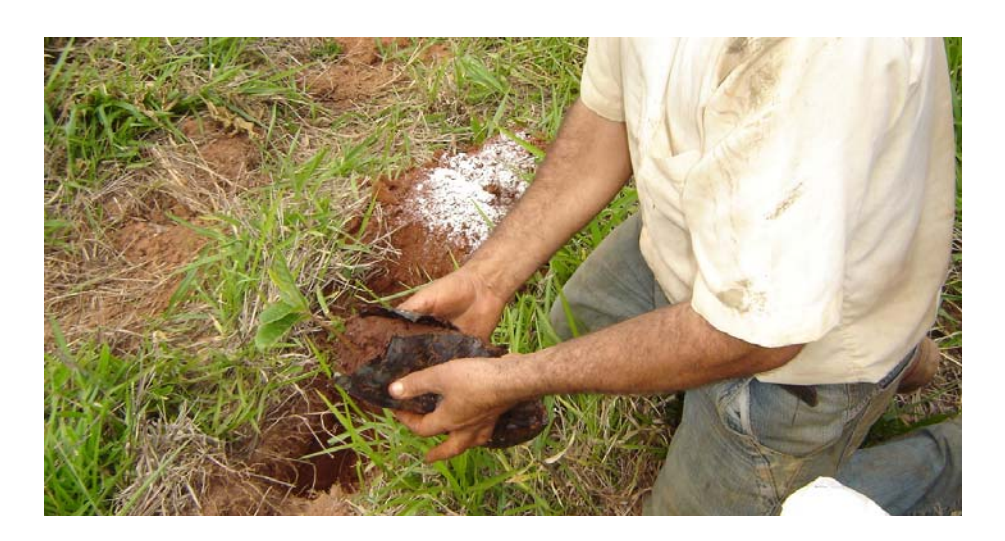
FIGURA 2 Plantio de muda de Annona crassiflora em cova adubada com 150g de super-simples e aberta sobre o sulco do subsolador.