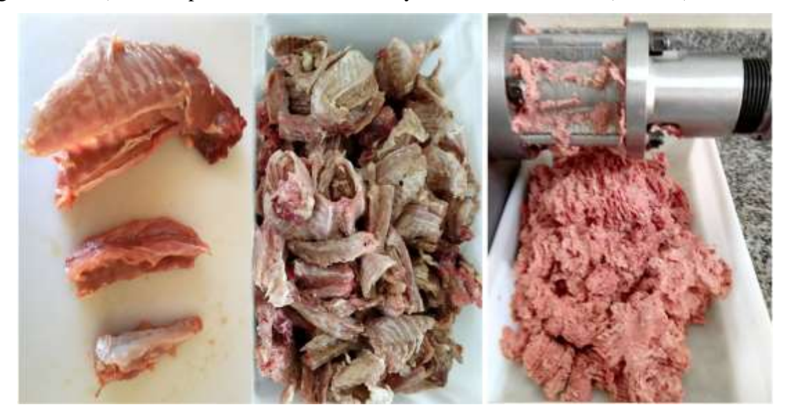
Figure 2. Photographs of the rabbit raw material (bones of the manually deboned thoracic cage and flank) used to produce the mechanically deboned rabbit meat (MDRM).

machine (PV Máquinas; Chapecó, SC, Brazil). Foreleg and hind leg bones were not used due to the limitations of the mechanical deboning equipment. The frozen bones were grouped in three batches (replicates), cut into smaller pieces with a cleaver and then processed. As a reference, mechanically deboned poultry meat (MDPM) was also prepared from poultry backs and necks, with skins, obtained (triplicate) in local trade.