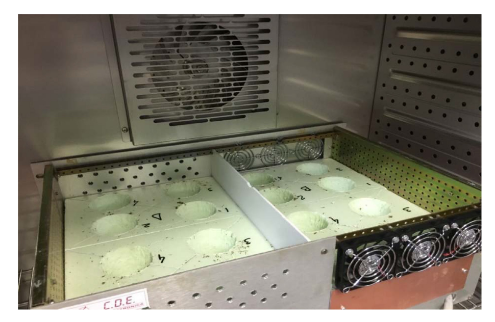
Fig. 1 - The custom container used to simulate air velocity and sample temperature (the top cover was removed to provide a view of the inside).

This SampleT was selected based on the results of previous studies conducted in compost-bedded pack barns, which indicated that the temperature of actively composting packs increases with depth, generally being very close to ambient temperature at the pack surface and reaching a maximum of 50–60 °C at 25–30 cm depth (Bewley & Taraba, 2017). So, as the sample jars used in the current experiment were only 50 mm deep, a temperature of 35 °C can be considered representative of an intense pack composting process. To simulate the conditions occurring in a pack that was not actively composting, we did not equip areas B and D of the custom cabinet (Figs. 1 and 2) with a heating system. In addition, a 6 mm-thick