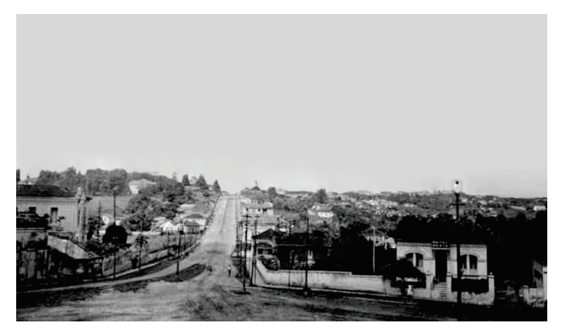
Figure 5. The area of the Train Station Square in the 1930's and Avenida XX de Julho (currently Avenida Pedro Sales ), still unpaved. Unknown author. Source: Bi Moreira Museum.

the presence of street lighting with public light poles. The roads remained unpaved. Nevertheless, it was possible to see some new residences in the surroundings (Figure 5).