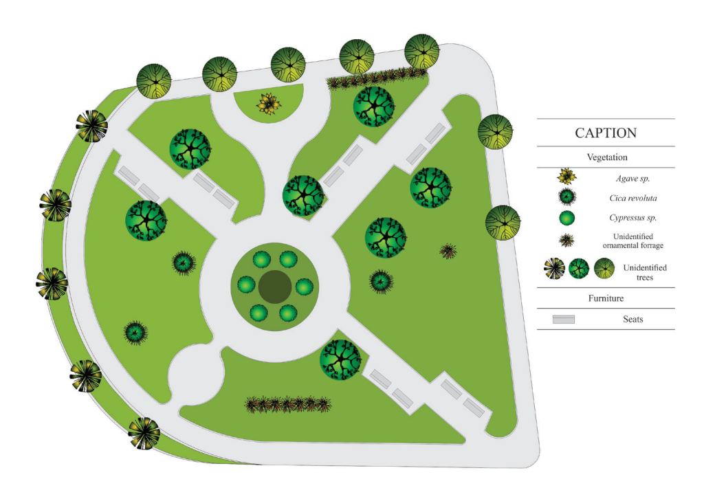
Figure 8. Reconstitution of the project for Dr. José Esteves Square at the time of inauguration. Author: Iracema C. A. Luz.

does not allow this research to infer whether if it was lost or if the design never existed. In order to better understand and discuss the space, a redrawn was made by the authors, based on photographic records, collected data and field observations made by the authors in 2017. The redrawn is shown in the image below (Figure 8).