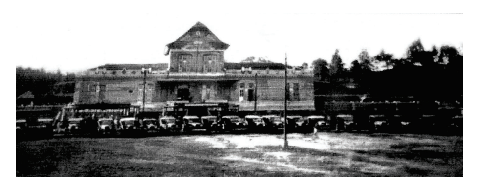
Figure 6. The Train Station of Lavras. Photo from the day that President Getúlio Vargas and his group visited the town, in 1931.

From another point of view, an image from 1931 shows the area used to be a simple parking lot (Figure 6).