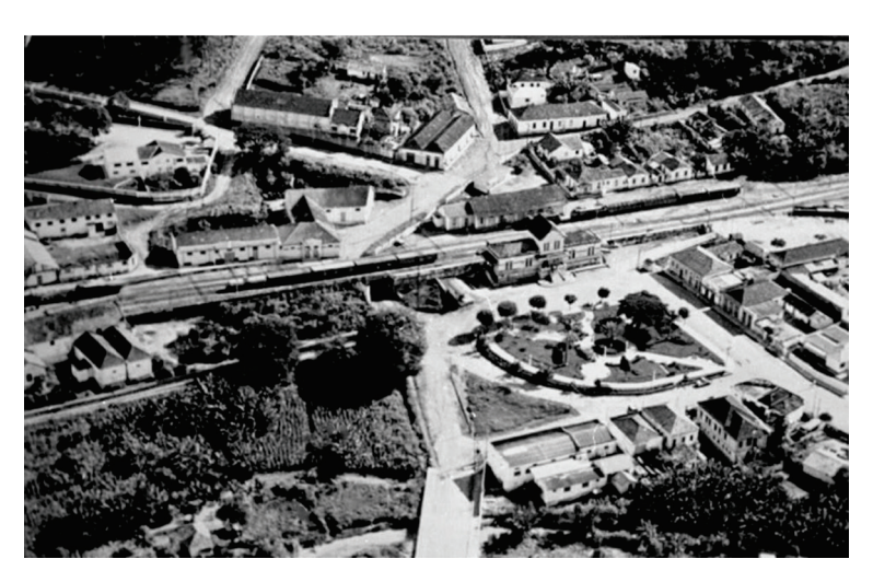
Figure 9. Aerial image of Dr. José Esteves Square and its whereabouts in the 1960's.

woodshops, company's offices, engineers' houses, the Train Station bridge, the Train Station itself, railroad shops, among other buildings that belonged to the company (DELPHIM, 2014).