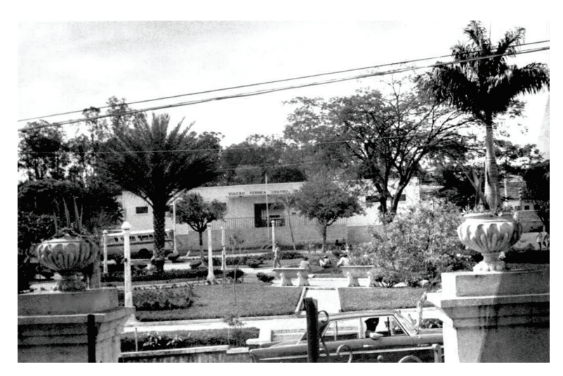
Figure 10. The Train Station in 1969. Unknown author. Source: Renato Libeck's personal archives.

Despite such improvements, the public square would not always be properly cared for; the public square maintenance would frequently be done by residents (DELPHIM, 2014). Because of the dedication offered by the population, mainly railroad workers who resided nearby the public square during the 1970's and further years, the public square became a reference for the city gardens.