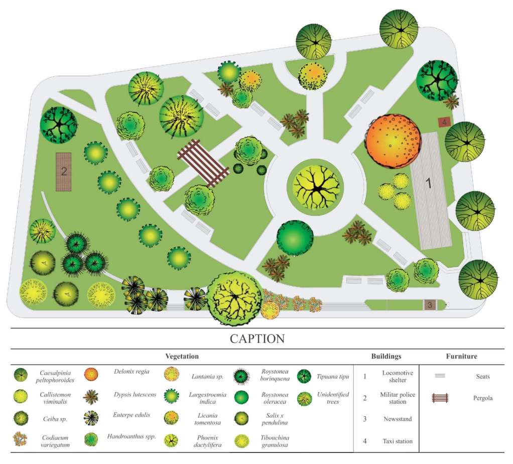
Figure 12. Current situation (2016) of Dr. José Esteves Square.

regia), "sibipiruna" (Caesalpinia peltophoroides) (Figure 15), trumpet tree (Tabebuia spp.), "oiti" (Licania tomentosa), areca palm (Dypsis lutescens) (Figure 16), weeping willow (Salix x pendulina) (Figure 17), imperial palm (Roystonea olearacea), juçara palm (Euterpe edulis), Puerto Rico royal palm (Roystonea borinquena), rosewood (Tipuana tipu), crape myrtle (Largestroemia indica), lantana (Lantana sp.), Kapok (Ceiba sp.), glory trees (Tibouchina granulosa), ipes (Handroanthus spp.) (Figure 18); all these plants have no relation to the first project of the public square.