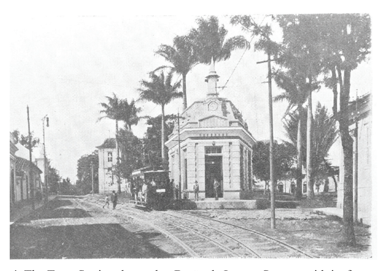
Figure 4. The Tram Station, located at Barão de Lavras Square, with its famous clock (1911). Unknown author: Source: Bi Moreira Museum.

installed in another building, the city's Tram Station, where people would buy tickets (Figure 4).