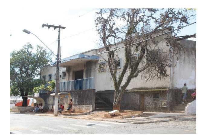
Figure 11. Current façade of the Train Station of Lavras. Author: Iracema C. A. Luz.

The old buildings around the Train Station, once used as shops and offices, are also being ruined, either by abandonment or bad weather effects.