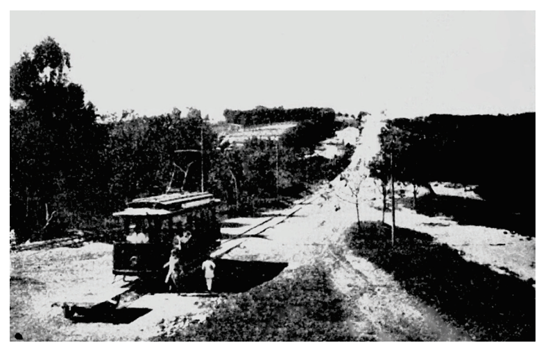
Figure 2. Previous location of Dr. José Esteves Square. Unknown author. Source: Bi Moreira Museum.

possible to see the tram, which would connect the station to the city center, and dirt roads.