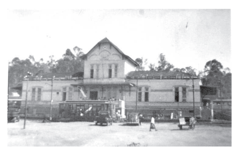
Figure 3. The Train Station of Lavras after remodeling, in the 1930's. Unknown author. Source: Renato Libeck's personal archives.

for telegraphists, a remodeling process was necessary to amplify the space, which was made by RMV – Rede Mineira de Viação (a company founded after EFOM was liquidated, and that took over the railroad transportation in Lavras), increasing the proportions of the Train Station (COIMBRA, 2009), under an eclectic style (Figure 3).