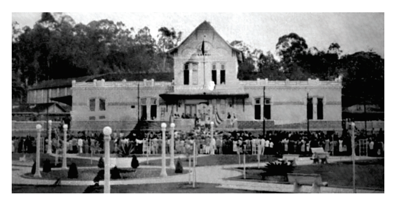
Figure 7. Inauguration ceremony of the Train Station Square in Lavras, most likely in 1951. Unknown author. Source: Renato Libeck's personal archives.

inauguration, shows people gathering in front of the Station for the ceremony. The photo also reveals part of the landscape design, that included cypress trees ( Cupressus sp.,), sago palms ( Cycas revoluta ), foraging (species could not be identified) and young tree species, with geometrical flower beds and a circular bed at the center of the public square (Figure 7). Native and foreign species were used jointly, without a defined style.