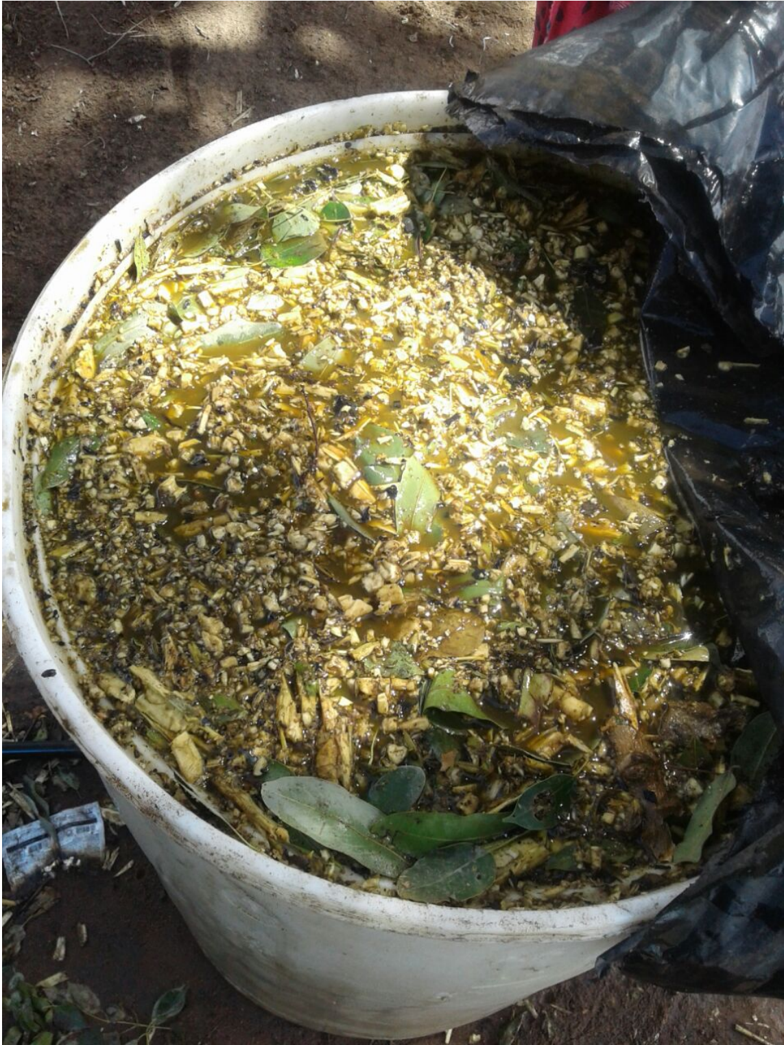
Figure 2. Barrel to produce biofertilizer