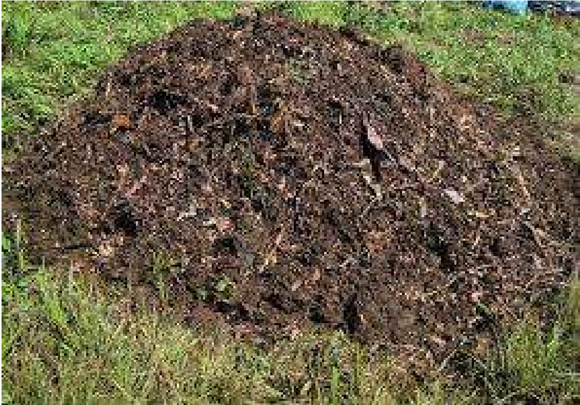
Figure 1. The mounting of the heaps

Time of composting: The time for decomposition of organic matter depends on several factors. The greater the control of temperature and moisture conditions the faster the process will be. If the nutrient requirements of the heap or small cultivated plot are satisfactory, the added materials of small sizes, the adequate moisture maintained and the heap revolved every week, the compound will be stabilized within 30 to 60 days and cured between 90 to 120 days. After this period, it will be ready to be used. It is noticed that the compound is ready when there is no loss of water, it is dark in color, it is loose and it smells of earth. When rubbing the compound between the hands, they do not become dirty.