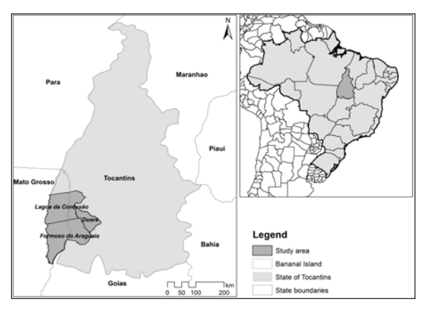
Figure 1 - Study area. The position of the three municipalities within the state of Tocantins and the border of the Bananal Island indigenous area on the left. The total area is 27,412 km², (3,424 km2 in Dueré, 13,423 km² in Formoso do Araguaia and 10,564 km² in Lagoa da Confusão), within which forest cover represents the 70% of the total area. The position of Tocantins within Brazil is on the right.

According to the Koppen classification, the climate is seasonal: the wet season is from October to March and the dry season from April to September (Klink and Machado 2005). The annual mean temperatures range from 22°C to 27°C and the annual rainfall from 1'300 to 1'900 mm (Alvares et al. 2013). In this fire dependent/influenced ecosystem (Hard-