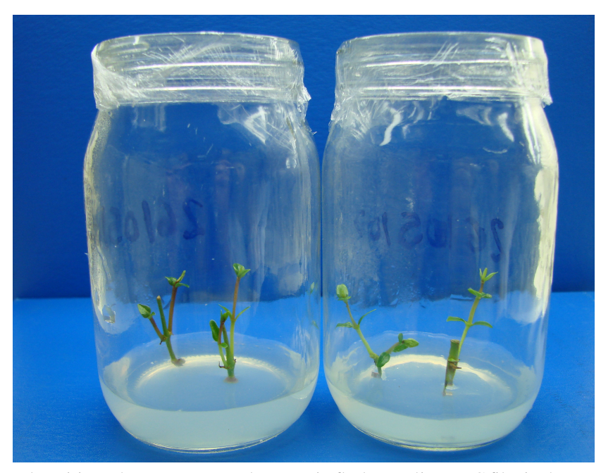
Figure 1 – Mangaba adventitious shoots regenerated in vitro in flaskes sealing PVC film in the establishment phase at 30 days.