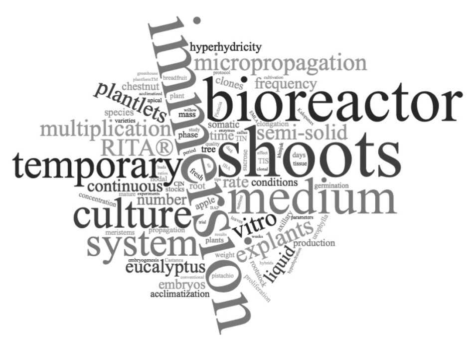
Fig. 3. Word cloud of recurrent key-words on the papers' titles and abstracts.

Although eucalyptus was the most studied species, other species of great economic interest also appeared in the papers, such as apple, followed by chestnut and pistachio (Chakrabarty et al. , 2003, 2007; Zhu et al. , 2005; Troch et al. , 2010; Akdemir et al. , 2014; Tilkat et al. , 2014; Vidal et al. , 2015a).