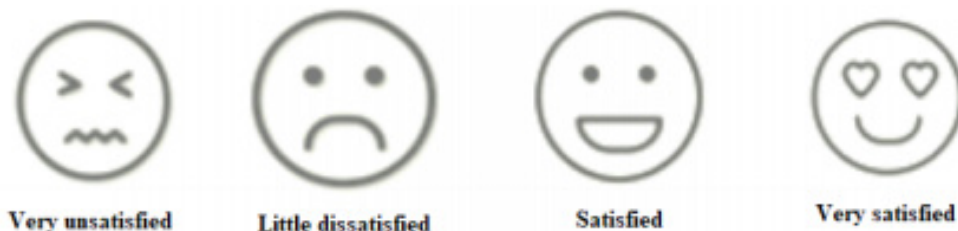
Figure 3. Categories Chart.

In addition to a simplification of topics and categories, such as the combination of Engrossment and Pleasure Factors, elements related to the objective of the educational game, its ability to combine gameplay with learning, issues related to content and pedagogical needs were added.