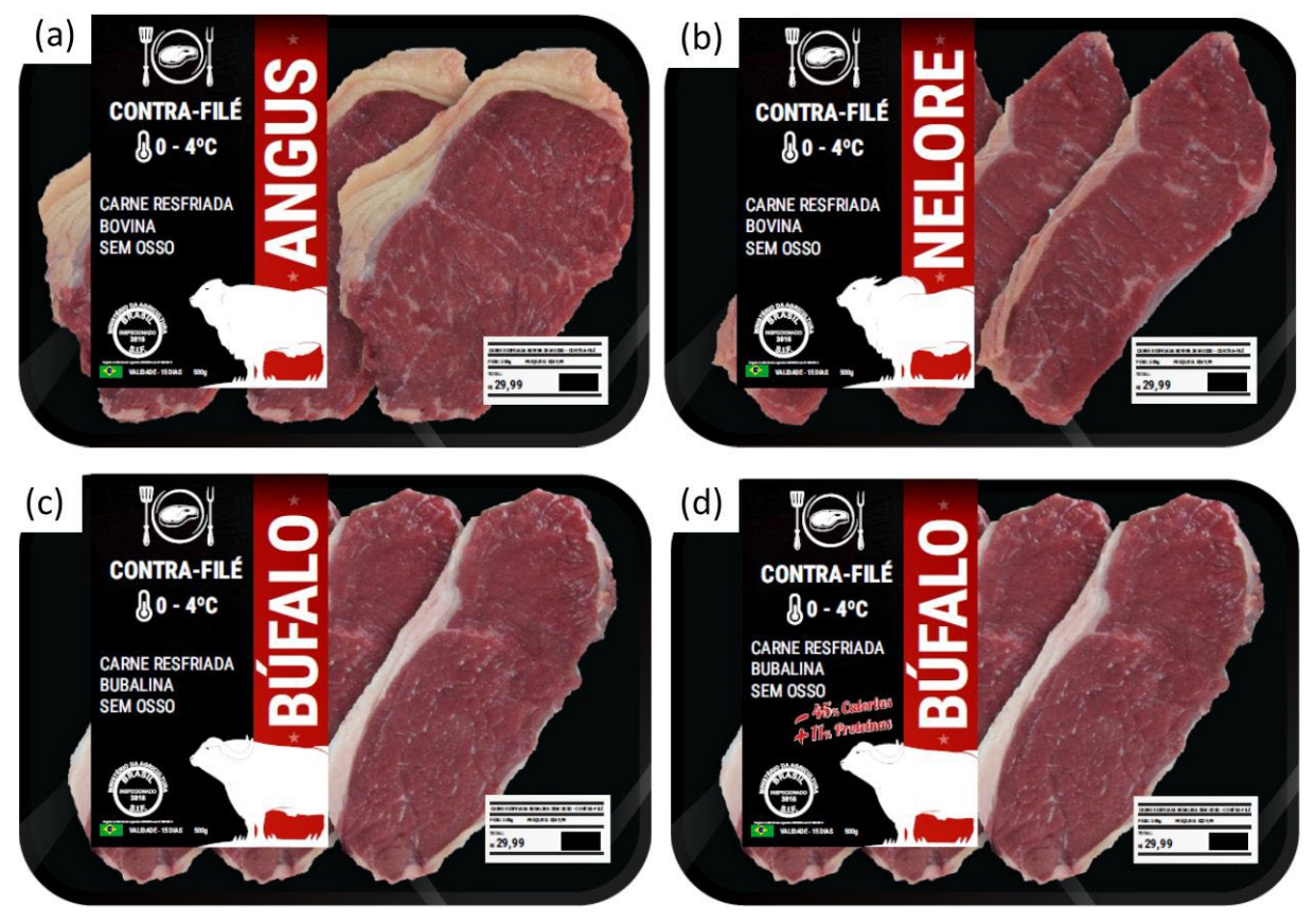
Figure 1. Some images used to simulate the marketing conditions for retail display evaluated in conjoint analysis: beef ribeye rolls of (a) Angus, (b) Nellore, and buffalo (c) without and buffalo ribeye rolls with nutritional claim (d), both with price of R$29,99/kg.

Virtual labels and price tags for the test were developed in CorelDRAW® 2019 according to the Brazilian food labeling standards. The design of the label and product brand were standardized, differing only in regard to the information on the meat type, the presence of nutritional claims and the image of the animal muscle. The price tag was also standardized, containing only the basic information. Pictures of each type of meat, obtained as described in item 2.2, were used in the creation of virtual trays (Figure 1) simulating the marketing conditions for retail meat (retail display).