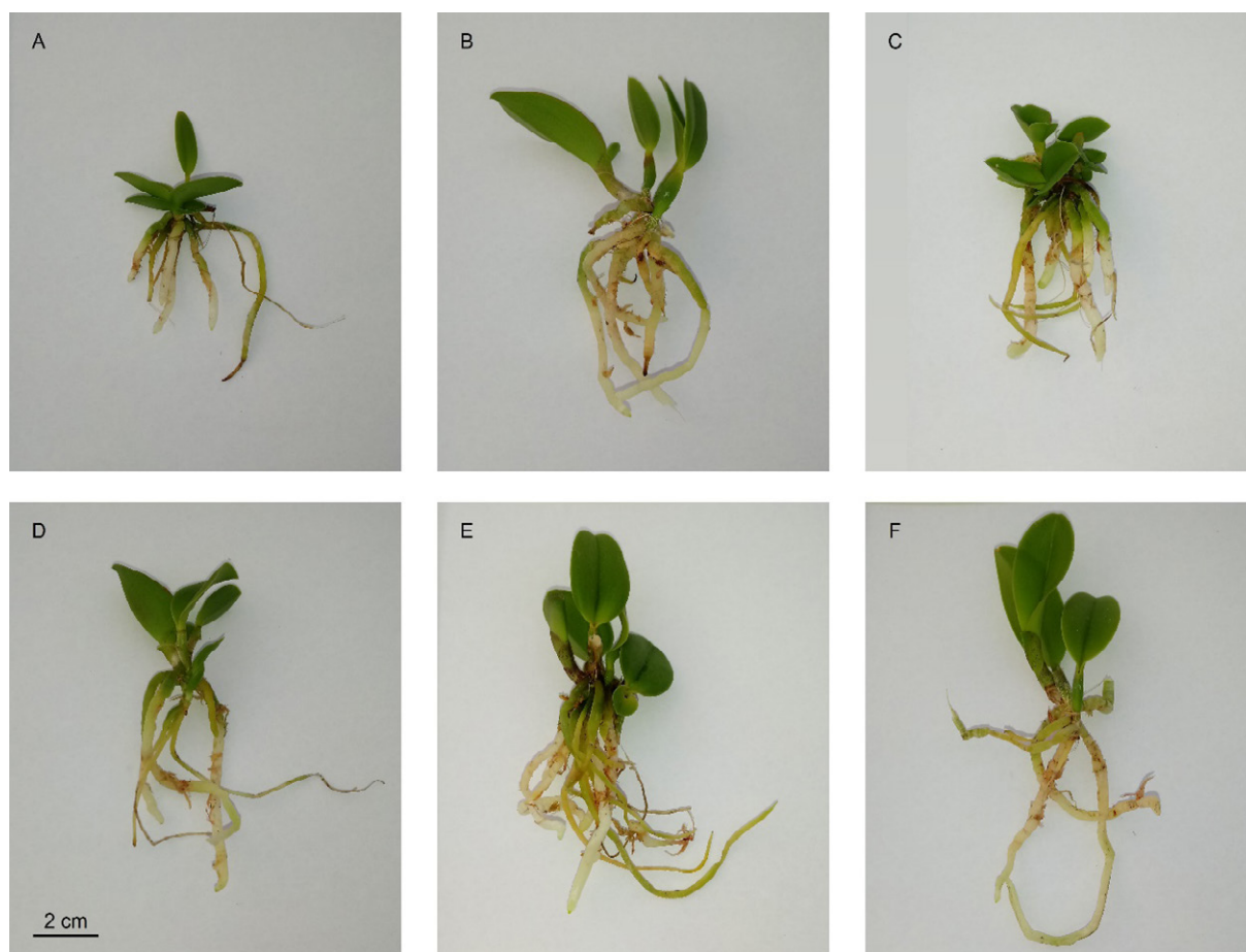
Figure 1. Cattleya walkeriana after acclimatization period. The treatments are represented by: A - White; B - Green; C - Blue; D - Yellow; E - 2 red:1 blue; F- Red.

Scott-Knott test at 5%. *Sameletters in the row do not differ statistically.