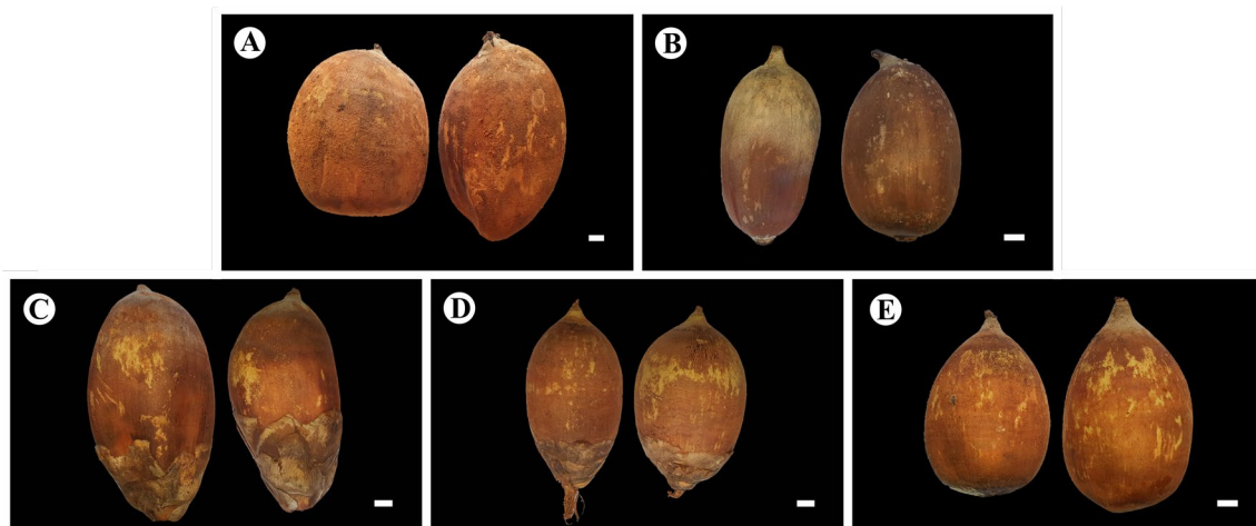
Figure 2: Visual variability of A. speciosa fruits collected in different municipalities of the State of Maranhão. (A) Buritirana - medium to large sized fruits, with an oval-ellipsoid shape. (B) Cantanhede - smaller fruits, with a more elongated shape. (C) Coroatá - longer fruits, with a wider base. (D) São Luís - ellipsoid-shaped and uniform fruits. (E) Viana - medium size, rounded-ellipsoid shape. Scale bar: 1 cm.

Our results are innovative because we identified traits with high and significant heritabilities, important to establishing selection criteria for future babassu breeding programs. This study is the first report on the genetic control of productive traits of babassu and offers the opportunity to select individuals with superior fruit and mesocarp production based not only on their location but also on their morphological traits. However, further studies are necessary to accelerate the process of domestication of this palm.